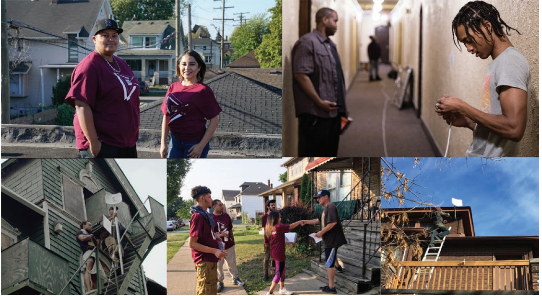
Detroit Digital Stewards install networking equipment.