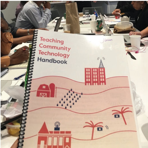
The Detroit Community Technology Project's Teaching Community Technology Handbook.

organisations, EII has now trained stewards across the city, and is already serving households in three neighbourhoods. 45 It has also successfully negotiated contracts for wholesale backhaul and transit with independent ISPs to provide low-cost wireless gigabit speeds to residents in its partner neighbourhoods, employing local Digital Stewards to perform