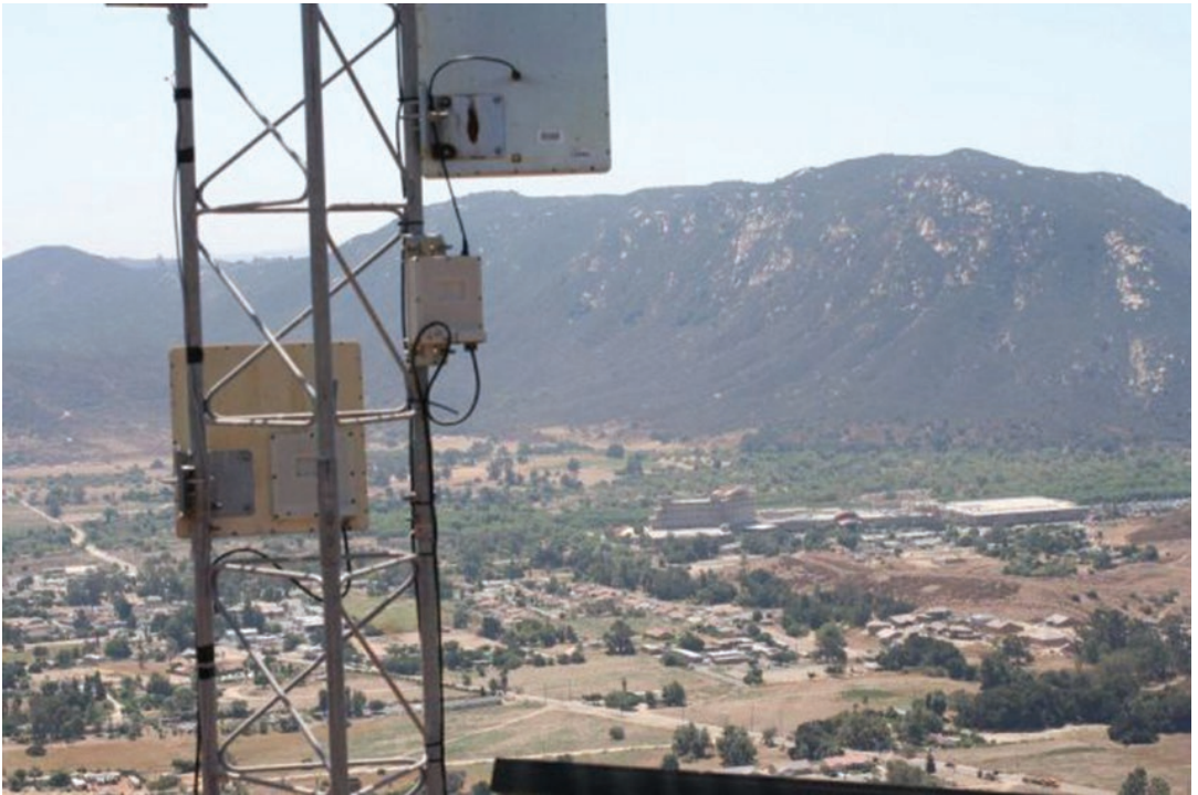
An access point tower constructed by Tribal Digital Village overlooks Pala, California.

global effect by catalysing the recent repeal of net neutrality (the Open Internet Order of 2015). 12