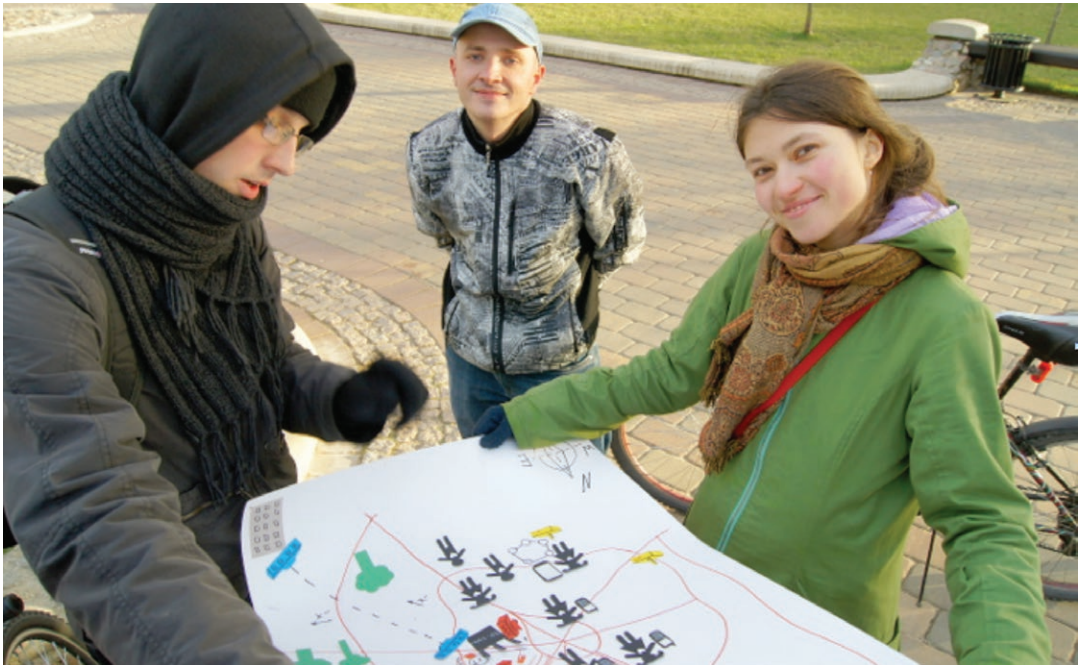
International Community Technology Seed Grantees.

competing demands on their time personally and in their community leadership work. It would take more organising, tapping into local movement building, dedicated expertise and resources, plus a whole new approach to building a new tech-supported economy and a method for teaching different kinds of learners about how to build and maintain networks. Detroit's organisers and community technologists once again held the key to bringing these efforts together.